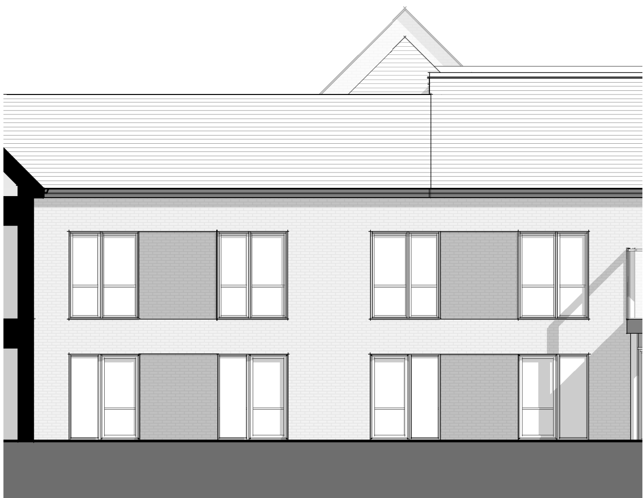
4 Courtyard Elevation K-K 1 : 100