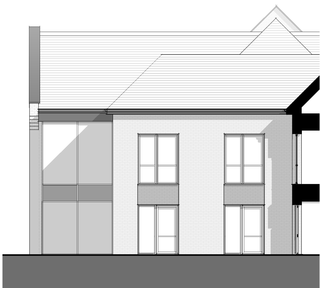
5 Courtyard Elevation L-L 1 : 100