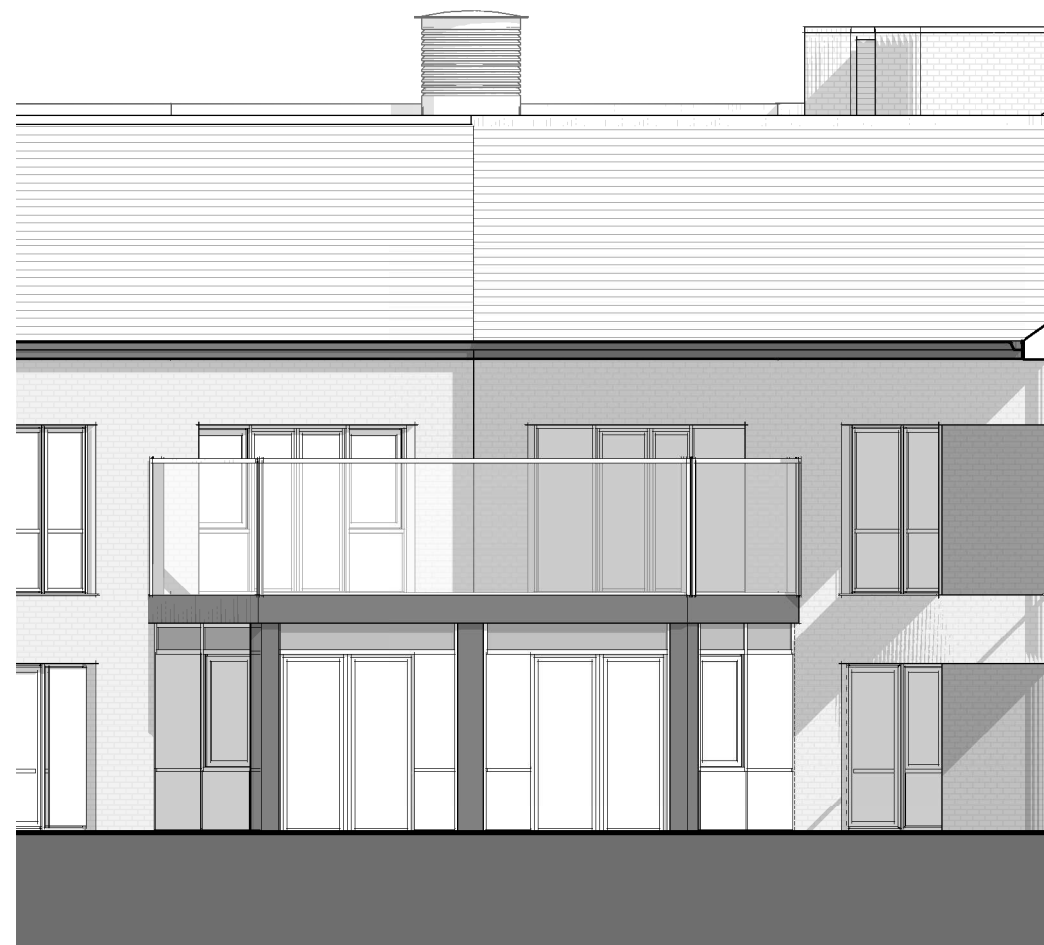
3 Courtyard Elevation J-J 1 : 100