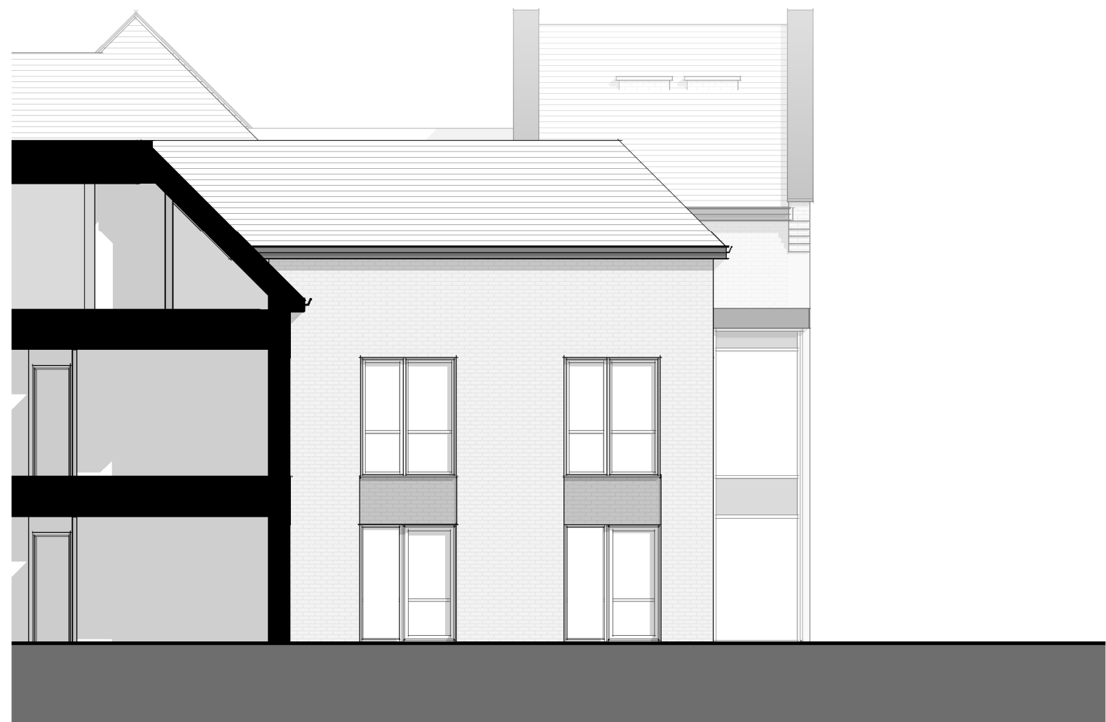
1 Courtyard Elevation G-G 1 : 100