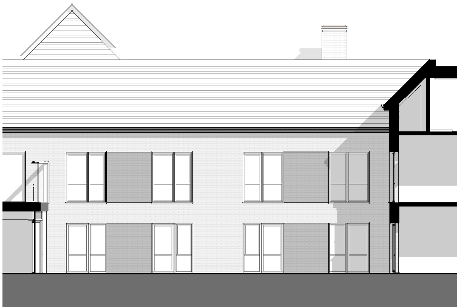
2 Courtyard Elevation H-H 1 : 100